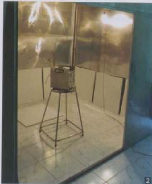
2. Experimental chamber to measure VOC emissions

An IAQ scorecard was prepared through a joint project of Rachana Sansad's Institute of Environmental Architecture and Godrej Interio in 2012. This involved three components – VOCs, Suspended Particulate Matter (SPM) and Microbial content. Interior spaces were categorized into Walls/ Partitions/